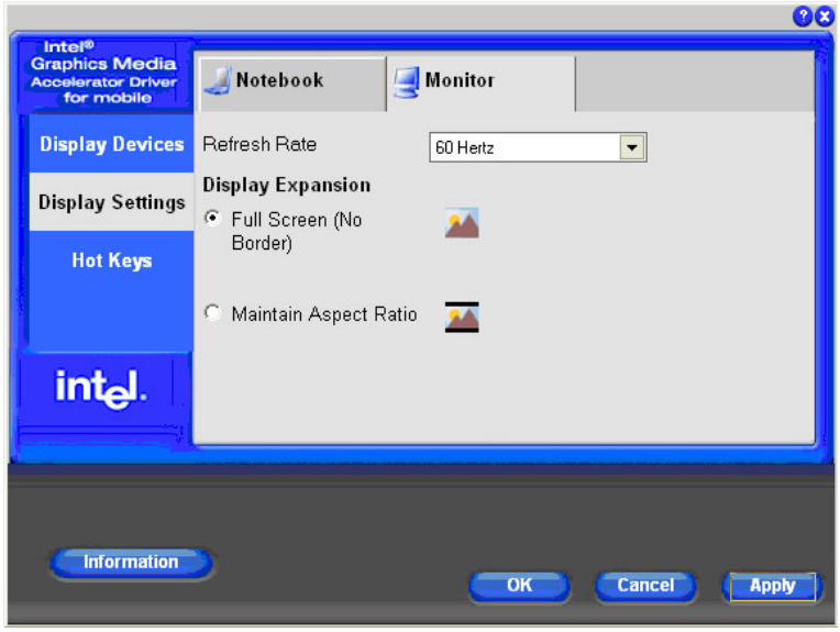
Finally – the computer should now be sending an adequate signal to the Projection device. Insure the projection device is set for the proper computer input.

Step 8. In the Intel GMA control panel, click on the "Display Settings" tab on the left-hand side. Click the "Monitor" tab at the top of the panel. Insure the screen refresh rate is set for "60 Hertz" and that the "Display Expansion" setting is set for "Full Screen (No Border)". Then click the "Apply" button on the lower right to accept the settings.